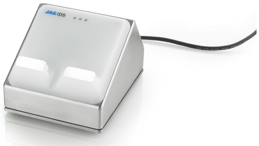
JAG IDS Desktop USB