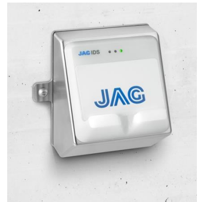
JAG IDS reader for wall mounting