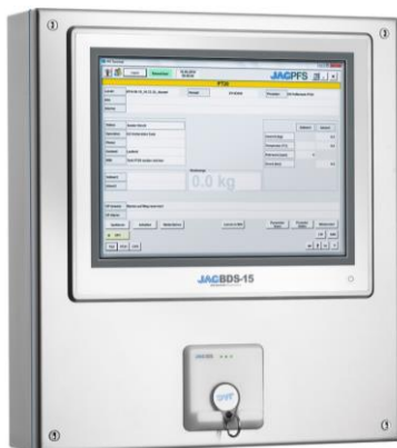
JAG IDS reader Bult-in version